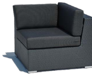
Corner Module 00097 H72 x D95 x W95cm