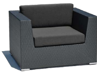
Lounge Chair 00099 H72 x D95 x W115cm