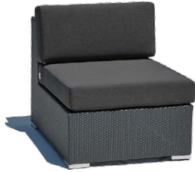
Centre Module 0098 H72 x D95 x W75cm