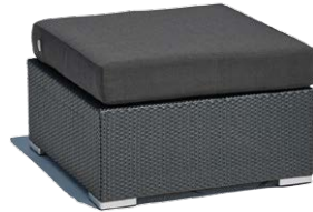
Footstool 00101 H33 x D75 x W75cm