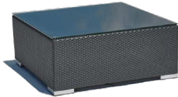
Coffee Table 01683 H33 x D80 x W80cm